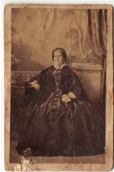
Studio portrait of a woman in dark elegant dress