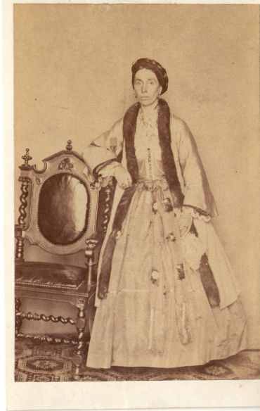
Studio portrait of Katarina Hadži Popović