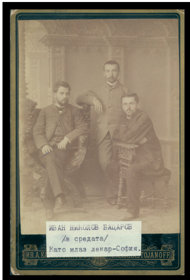
Group portrait of three men