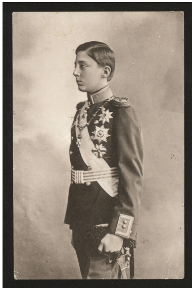
Prince Kiril of Bulgaria