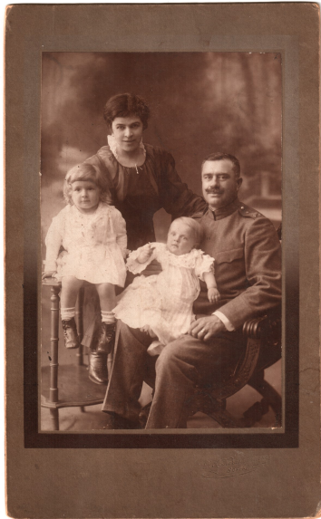
Studio portrait of the Popov family