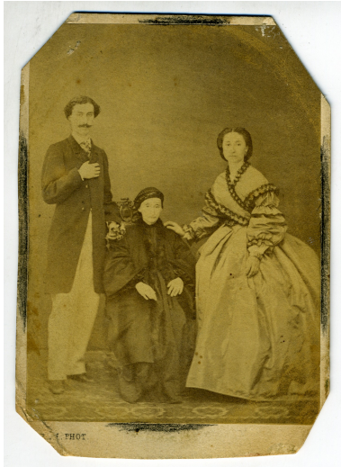
Studio portrait of two women and a man