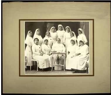
Studio group portrait of Samaritan women from World War I