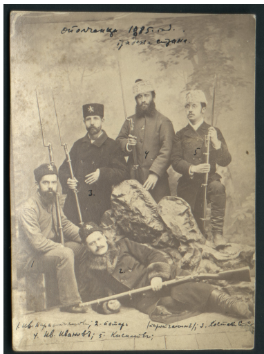
Studio portrait of volunteer combatants at the Serbo-Bulgarian War in 1885