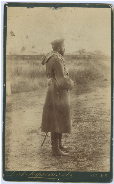
Prince Ferdinand I of Bulgaria