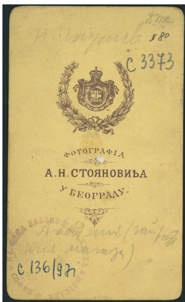
Studio portrait of Dobri Voynikov

Inv. No.: C 3373 License: This picture is licensed under Creative Commons [CC BY-NC-ND 3.0] ( http://