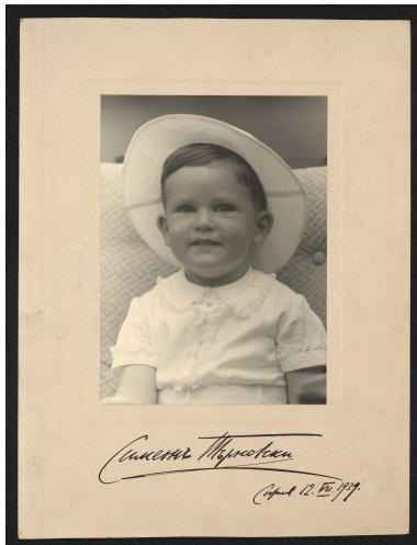
Portrait of infant Simeon Borisov of Saxe-Coburg and Gotha