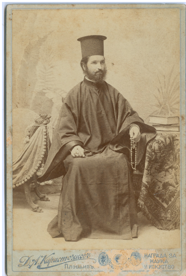
Studio portrait of the priest Dimitar Vakarelov