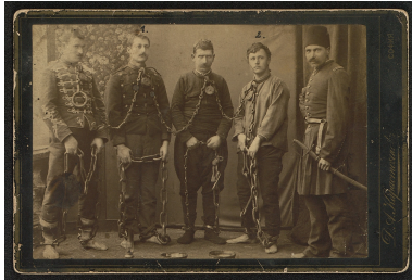
A staged scene of Bulgarian exiles in Ottoman prison

Object: A staged scene of Bulgarian exiles in Ottoman prison Description: Studio group portrait of four men. Two of them are wearing military uniforms, the other two are in rural clothes. None of them are wearing shoes. Three are barefoot and one is wearing socks. The four men are shackled together by neck chains. They are also wearing leg shackles. A man holding a sword and wearing a Turkish military uniform and a fez is standing to the right of the group.