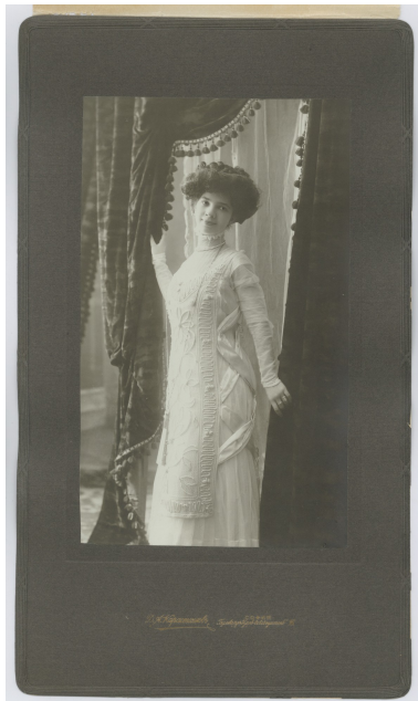
Vera Stambolova