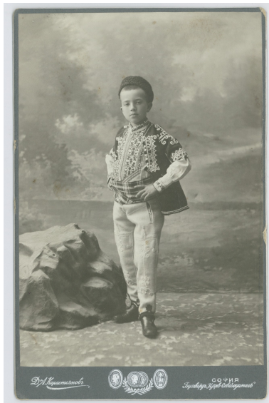
Studio portrait of Stefan (Asen) Stambolov as a boy in folk attire