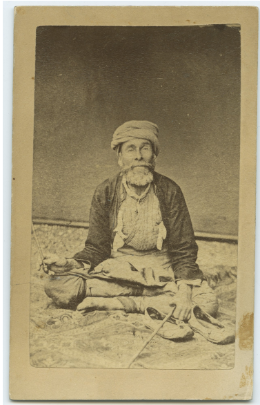
Studio portrait of a poorly dressed old man