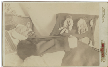
Stefan Stambolov on his deathbed