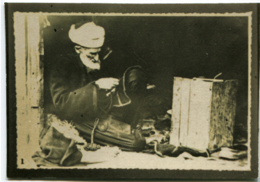
Tailor (terzija) at work