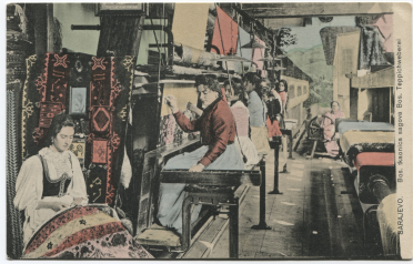
"Sarajevo. Bosnian Carpet Manufactory"