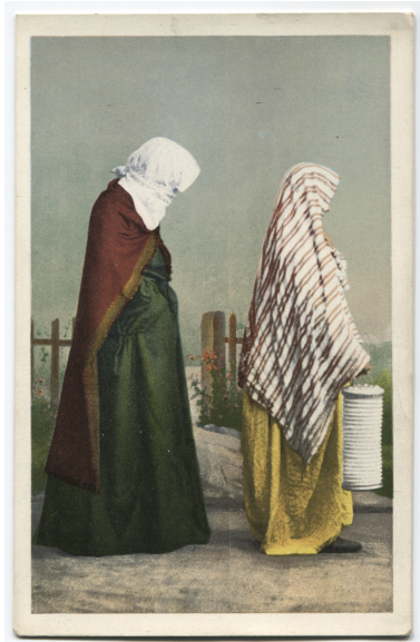
"Turkish Women In A Street"