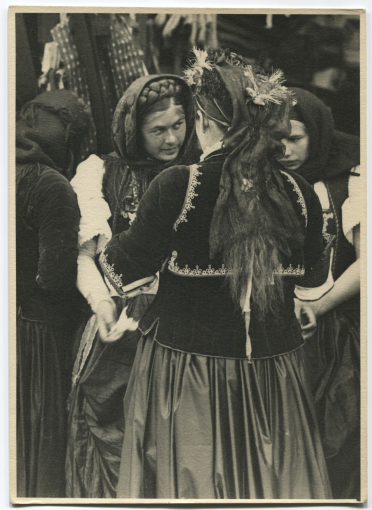
Folk costumes