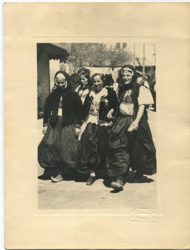
Traditional women's folk costumes