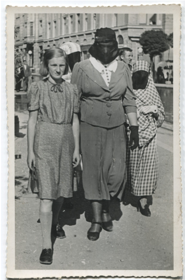
Muslim women's streetwear