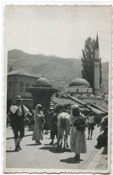
At the Sebilj fountain