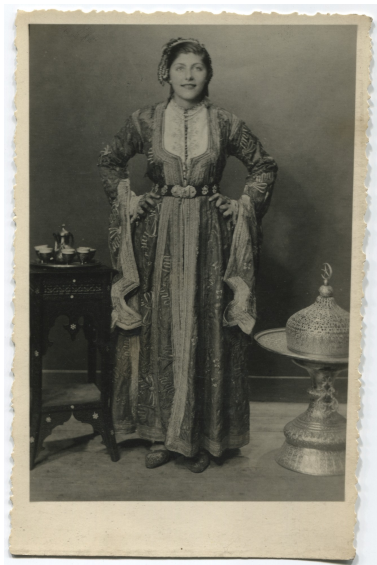
Studio portrait of a woman