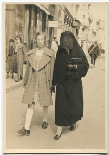
Muslim woman and a girl in the street