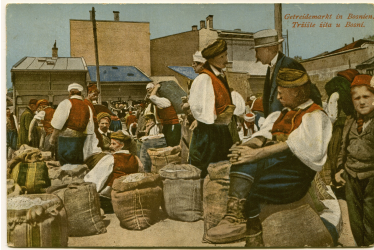
Grain trade in Baščaršija