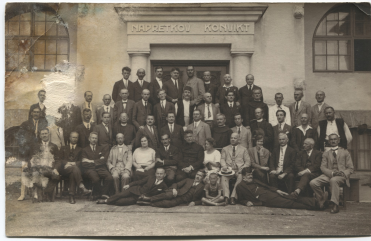
Group portrait of the board of the Croatian Cultural Association "Napredak"