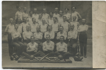
Participants of the Sokol Serbian teachers' course