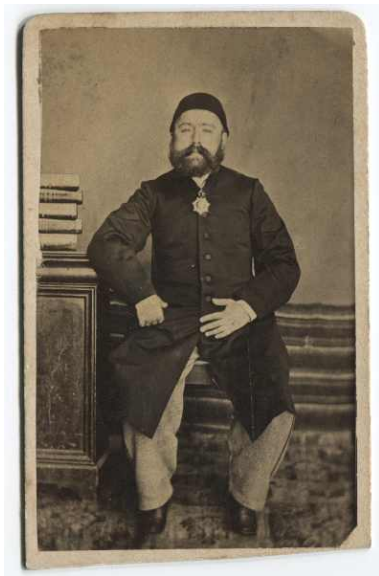
Studio portrait of a man