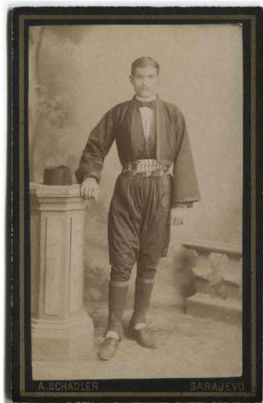
Studio portrait of a man