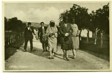
Country way