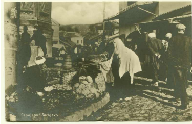
Street vendors at the Sebilj fountain