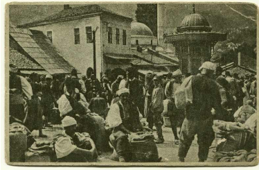
"Sarajevo. Market Day In Baščaršija"