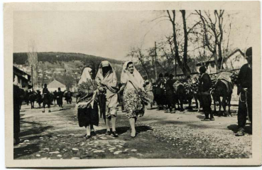
"Sarajevo - Kovači Street"