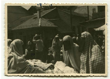
Market scene