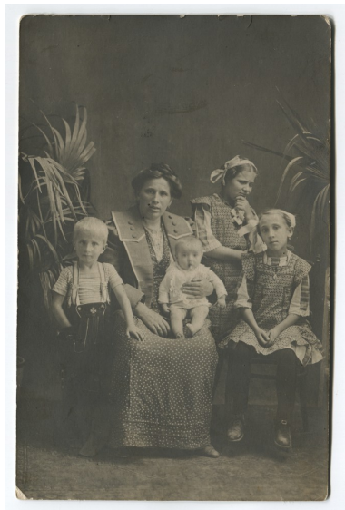
Studio photograph of a woman with four children