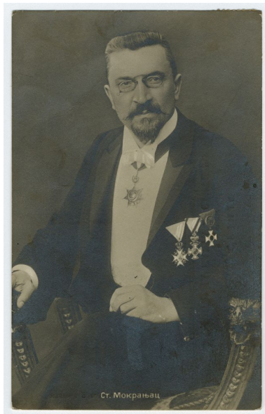
Studio portrait of composer Stevan Mokranjac