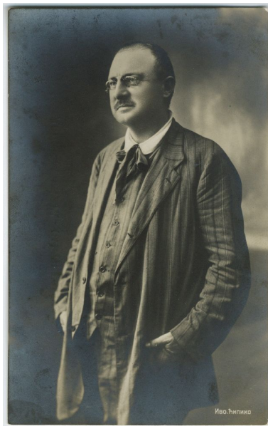
Studio portrait of poet Ivo Ćipiko