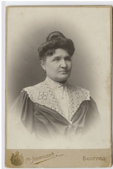
Studio portrait of Mileva Tošić