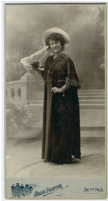
Studio portrait of Draga Spasić