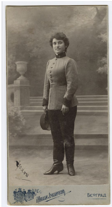
Studio portrait of Draga Spasić