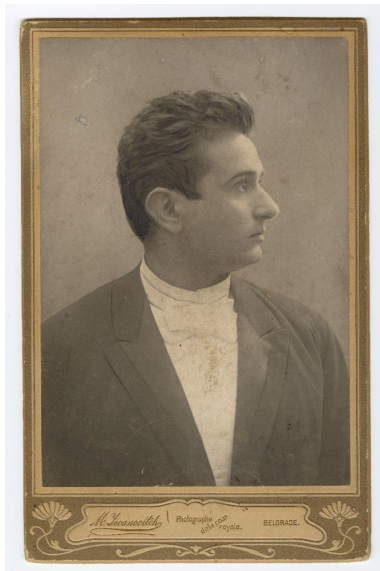
Studio portrait of actor Ljuba Stanojević