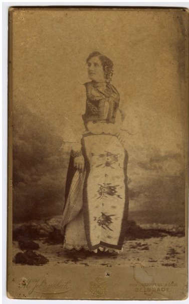
Studio portrait of actress Vela Nigrinova in character as 'Ljubica'