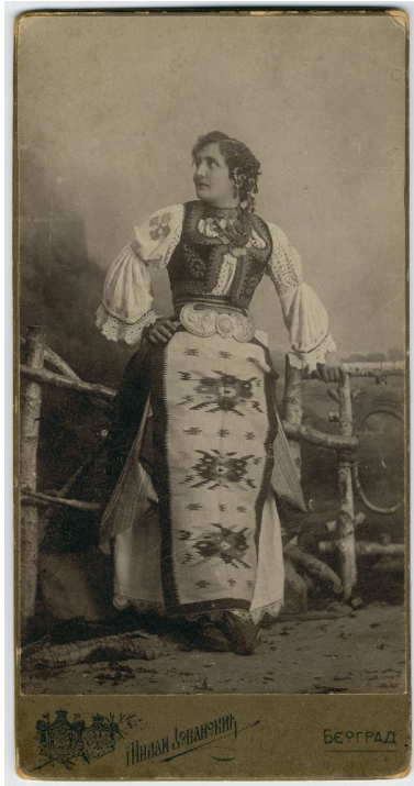
Studio portrait of actress Vela Nigrinova as 'Ljubica'