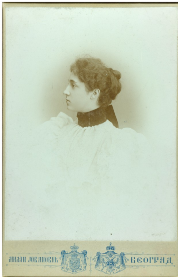
Studio portrait of Ms. Mara