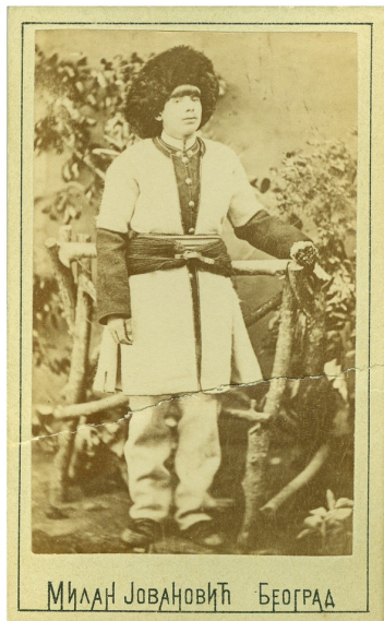
Studio portrait of a man in Vlach folk dress