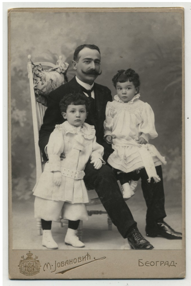
Studio portrait of a man and two children