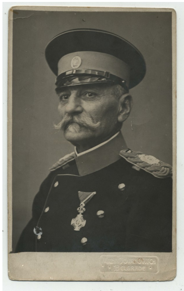
Studio portrait of King Petar I of Serbia