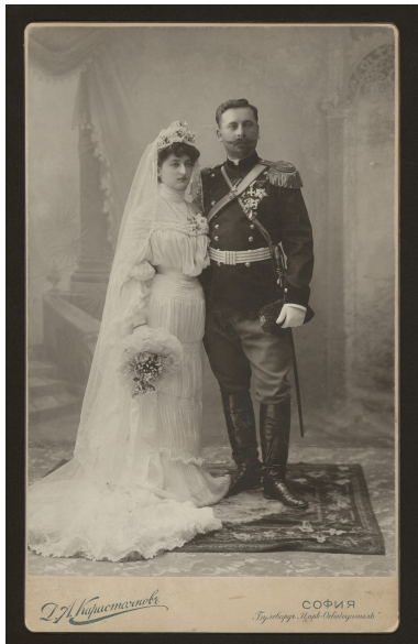
Wedding portrait of General Vladimir Vazov and Mara Goranova